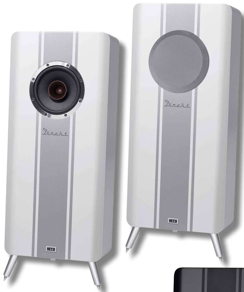
White & Silver